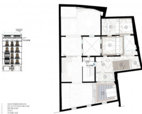
5 th FLOOR PENTHOUSE 02