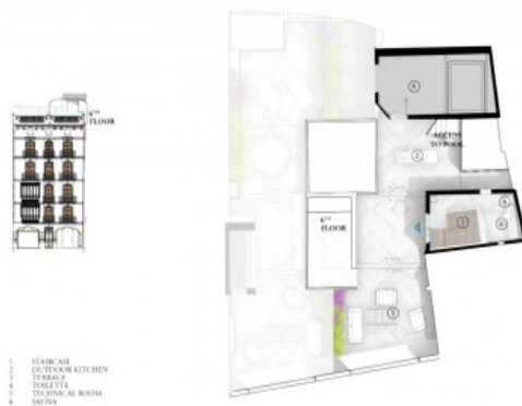
6 th FLOOR TERRACE PENTHOUSE 02