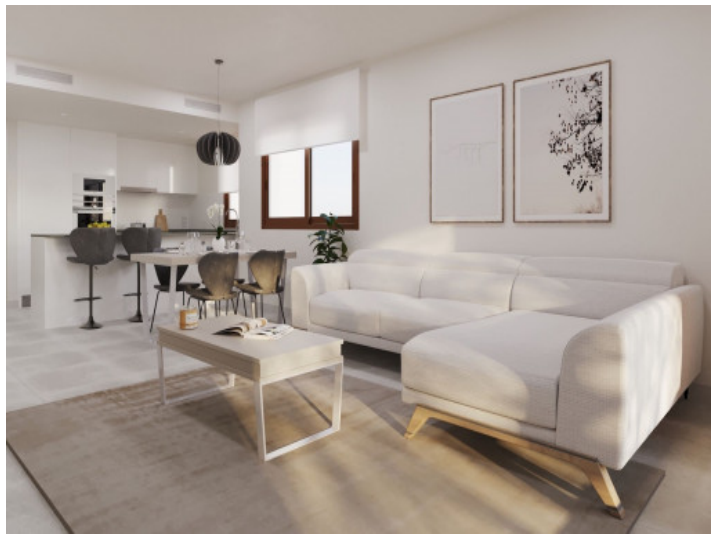
All information is correct to the best of our knowledge. Errors and prior sale excepted. This prospectus is purely for information purposes. Only the notarized deed of sale is legally binding.