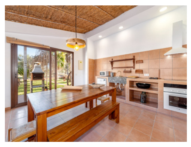
All information is correct to the best of our knowledge. Errors and prior sale excepted. This prospectus is purely for information purposes. Only the notarized deed of sale is legally binding.