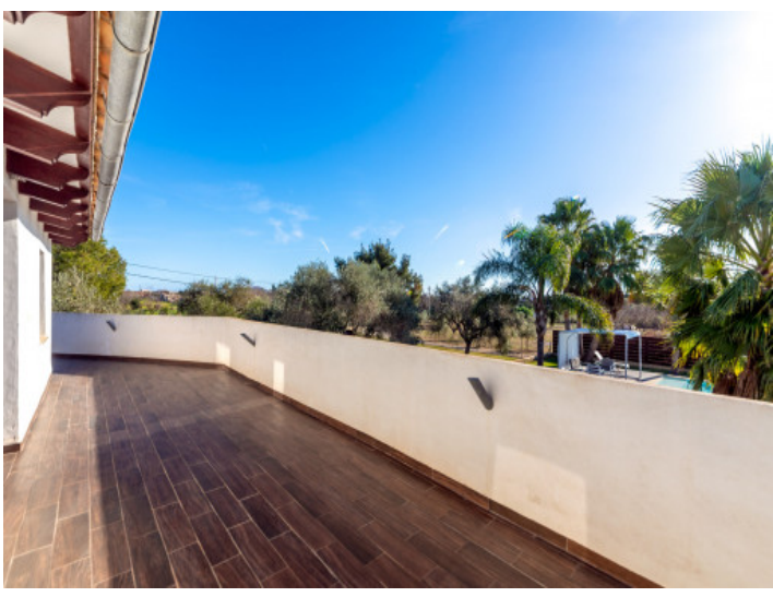
All information is correct to the best of our knowledge. Errors and prior sale excepted. This prospectus is purely for information purposes. Only the notarized deed of sale is legally binding.