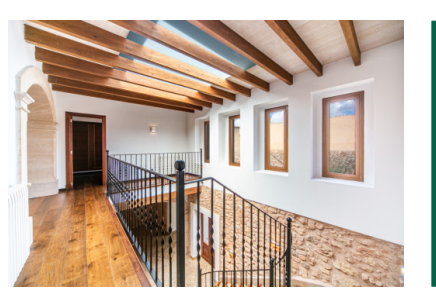
<mark>Algaida</mark> Объект № 115214