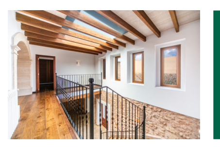
<mark>Algaida</mark> Объект № 115214

PORTA MALLORQUINA® Your home. Our passion.