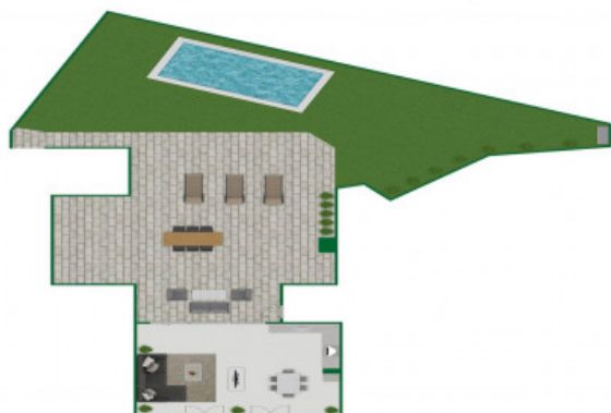
Exposéplan, nicht maßstäblich