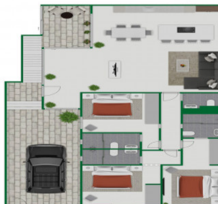
Exposéplan, nicht maßstäblich

All information is correct to the best of our knowledge. Errors and prior sale excepted. This prospectus is purely for information purposes. Only the notarized deed of sale is legally binding.