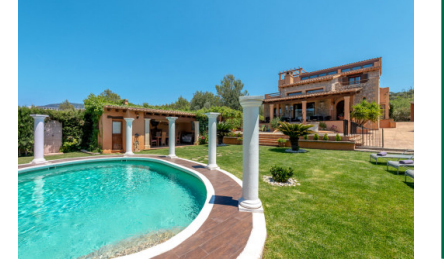
PORTA MALLORQUINA® Your home. Our passion.